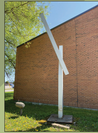
2 Kosso Eloul, Ingo , 1992, Steel Gift of the Artist