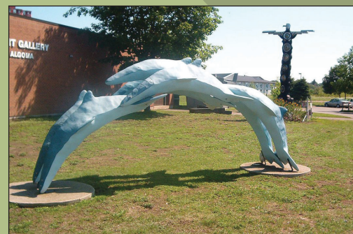
This sculpture is currently waiting to be restored.