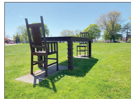
12 Andrew Dutkewych, Hole in the Sky , 1987, Steel Acquired through the Ministry of Culture and Communication