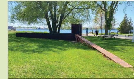
7 Murray MacDonald, Pivotal Divide , Undated, Steel Acquired through the Ministry of Culture and Communication